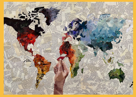
Miah Shaffer "Puzzle Pieces" ARTS GOGGLE FAVORITE HIGH SCHOOL