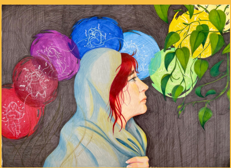
Brianna Valdez "Growing from Pain" CHAIRMAN'S SELECTION